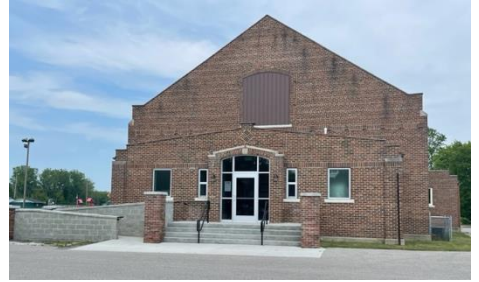
200 N. Mable Street (M-13), Pinconning, MI